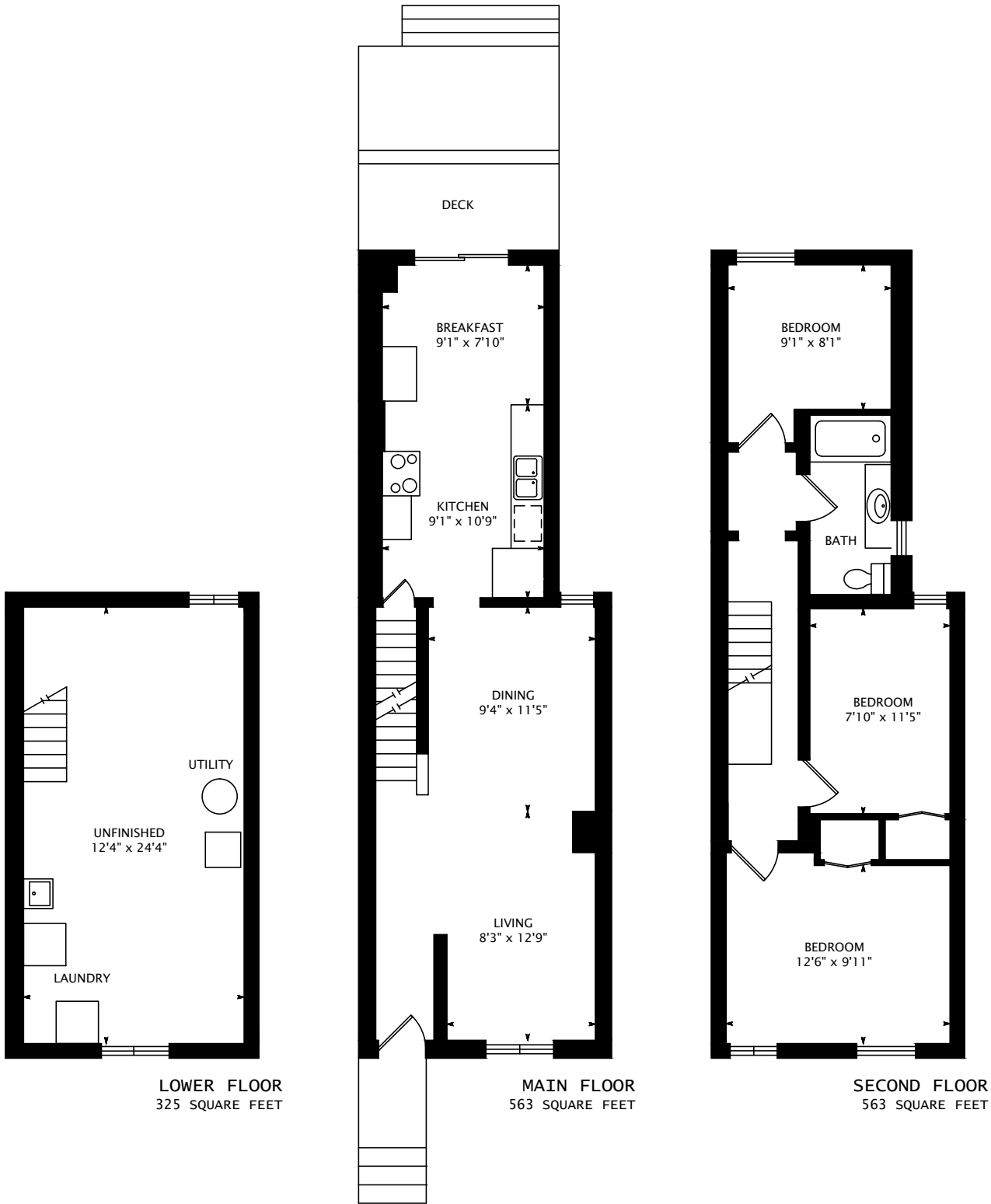
LOWER FLOOR 325 SQUARE FEET